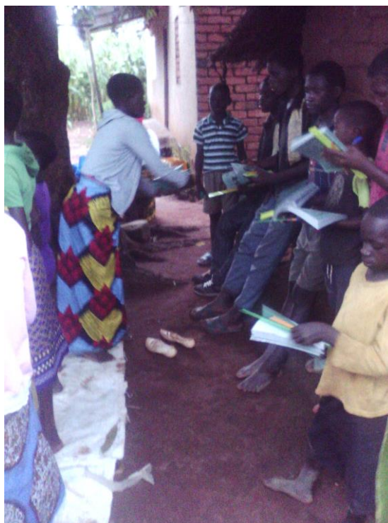
Jali kids receiving school materials