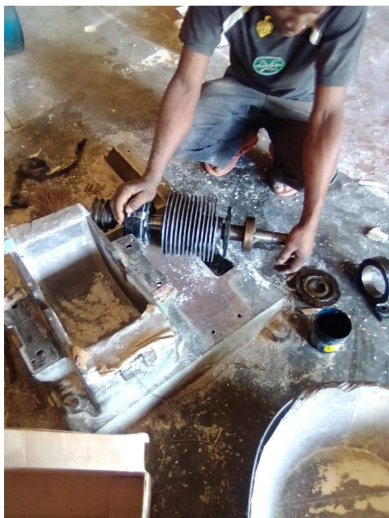
The maize mill being greased after a breakdown

I didn't promise them that the monies would be available but I told them that I would forward the message to the GERMAN BOARD for consideration. Of course if the possibility might be there, let's help these people, as we will be assured that the maize mill, will be in good condition and its purpose will be fulfilled. Of course I verified the prices of those spare parts in Blantyre, whether I could make good comparison, but the prices are similar.